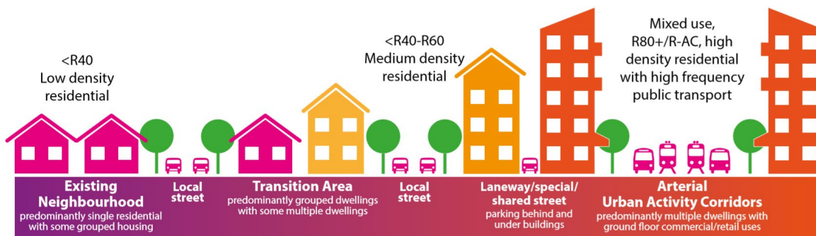
Figure 6: Typical urban morphology transect incorporating an activity corridor

Therefore, in this instance, Liveable Neighbourhoods is a useful WAPC planning policy to refer to, as it contains guidance and principles for the planning of urban activity centres. It promotes the widely accepted planning principle that the urban form surrounding mid-rise and high density urban centres should ‘transition’ or ‘step down’ to the existing single residential neighbourhoods that they are typically surrounded by in metropolitan Perth. This approach is depicted in the transect diagram below. It shows a gradual reduction in height and scale of the urban form through the transition area, thereby enabling a sympathetic and positive response to the low rise height and scale of the surrounding existing residential neighbourhood, at the point at which they meet.